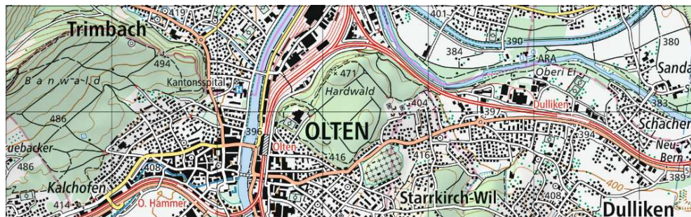
Figure 2. Swiss National Map 1:50 000 (DCM50), urban area, draft